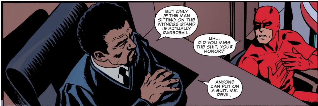
Figure 4. Panel from Soule's Daredevil: Back in Black Vol. 5: Supreme #21, 2017.

Image Credit: Goran Sudzuka © 2017 Marvel Characters, Inc