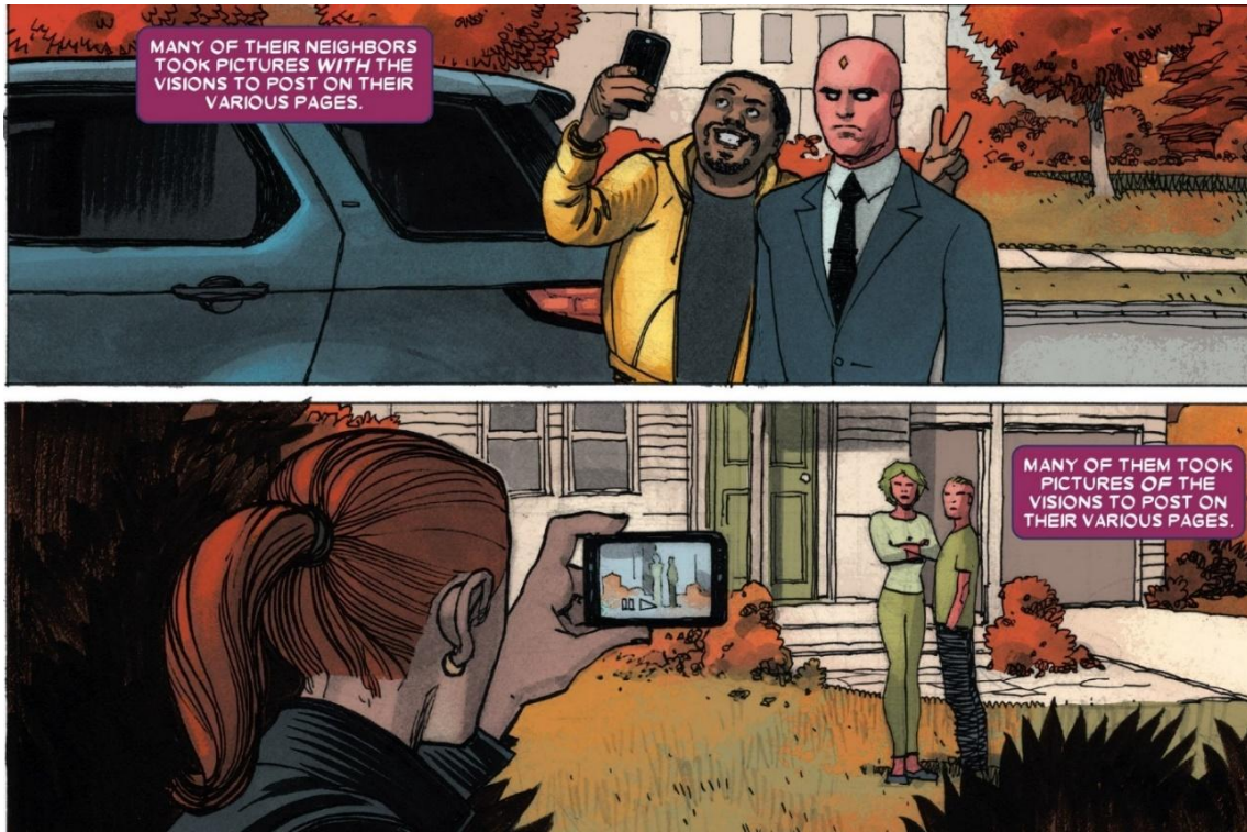
Figure 1. Vision is routinely subject to neighbourhood exploitation.