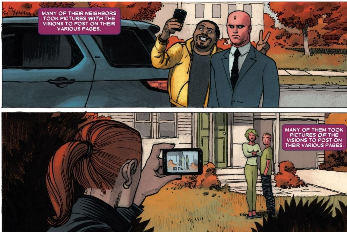
Figure 1. Vision is routinely subject to neighbourhood exploitation.