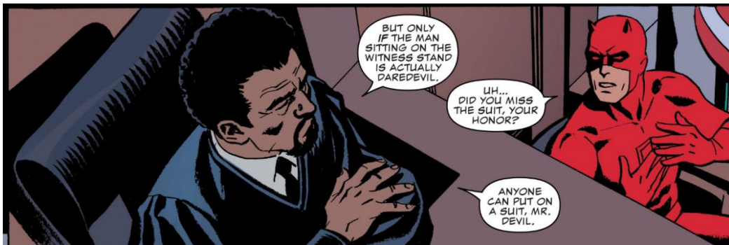
Figure 4. Panel from Soule's Daredevil: Back in Black Vol. 5: Supreme #21, 2017.

Image Credit: Goran Sudžuka © 2017 Marvel Characters, Inc