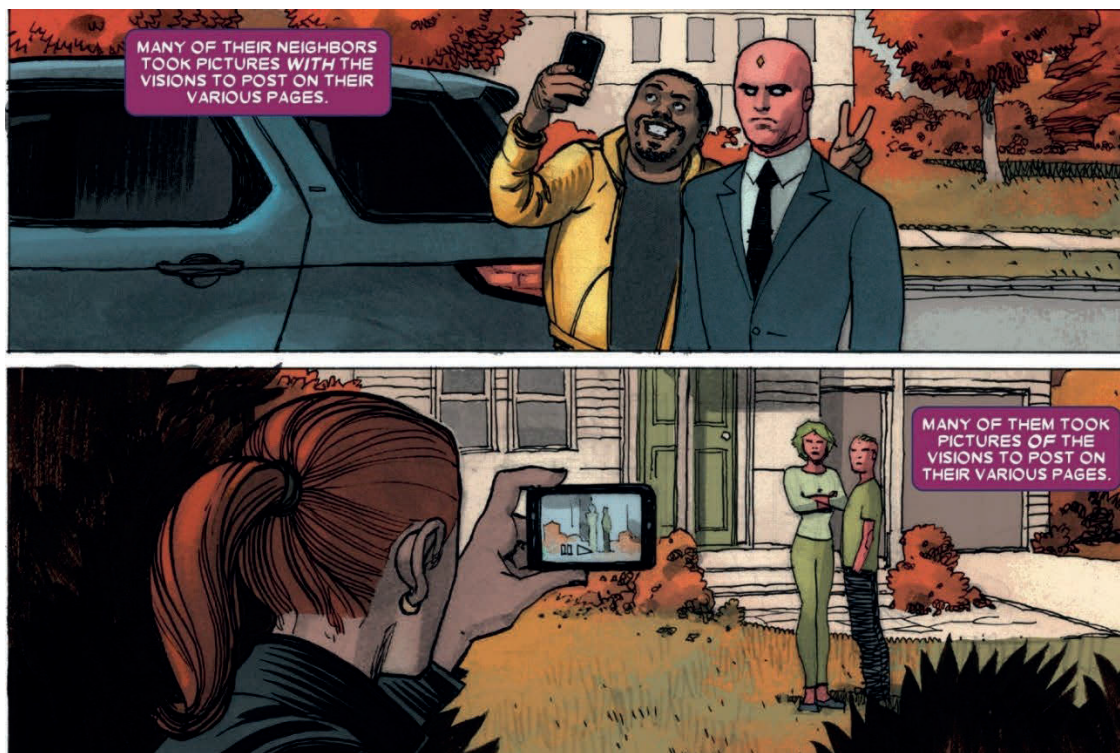
Figure 1. Vision is routinely subject to neighbourhood exploitation.