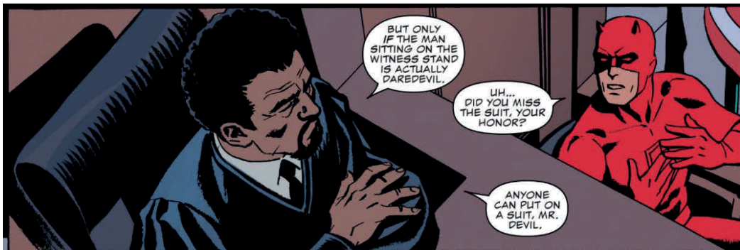
Figure 4. Panel from Soule's Daredevil: Back in Black Vol. 5: Supreme #21, 2017.

Image Credit: Goran Sudžuka © 2017 Marvel Characters, Inc